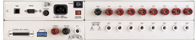
MODEL SC6540 HGM* 8 Channel High Voltage Multiplexer 8 Channel High Current Multiplexer