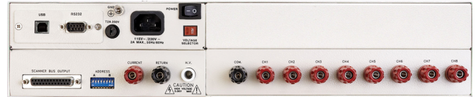
MODEL SC6540 GNM* 8 Channel High Current Multiplexer