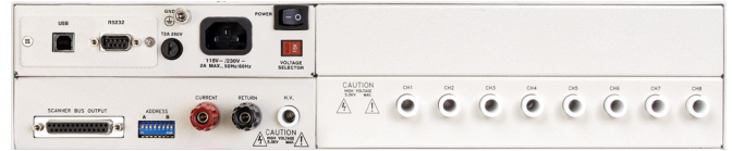
MODEL SC6540 HNM* 8 Channel High Voltage Multiplexer