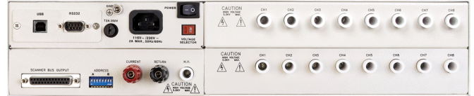
MODEL SC6540 HHM* 16 Channel High Voltage Multiplexer