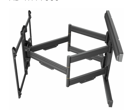
Recommended for heavier displays and longer arm