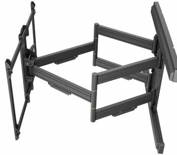
Heavy-Duty Full Motion Mount AD-WM-7060

Recommended for heavier displays and longer arm