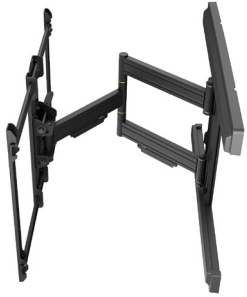
Full Motion Mount AD-WM-5060

Suits most full motion single display applications