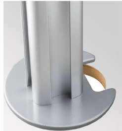
Grommet clamp AC-GC

Utilises an existing grommet hole or can be used as bolt through fixing. The plate provides extra stability for heavy loads. Fits grommet holes 60-80mm in diameter.