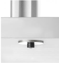
Bolt through AWM-FB

Offers flexible mounting position. Used when attachment to the edge of the desk is not possible. Suitable for desks up to 33mm.