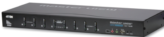
CS1768 front view