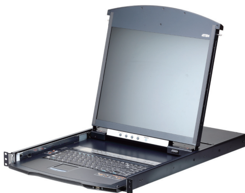
KL1116VN Front view