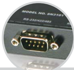
RS-232/422/485 3-in-1 serial Port