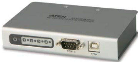
UC2324 / UC4854