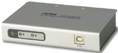
UC2322 / UC4852