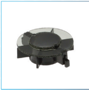
Mighty Scope 5M Polarizer #26700-217