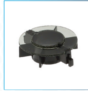
Mighty Scope 1.3M Polarizer #26700-216