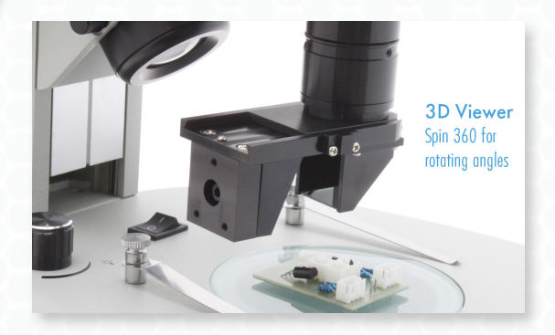
Inspect Parts from Any Angle