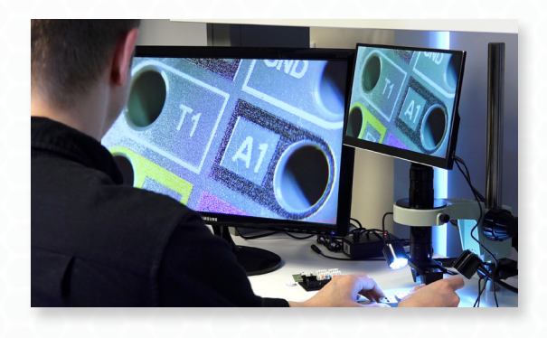
HDMI Mode (View on an HD monitor)

Track Stand Adjustable overhead & back light