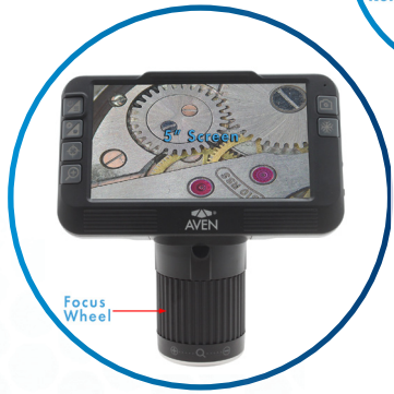
Crystal Clear 5" Screen