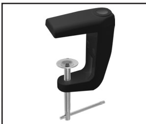
Heavy Duty Mounting Clamp

Color Temperature Range: 3500K—6500K LUX Rating: 6500LX LED lifespan: 20,00 hours minimum