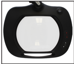
7.5" x 6.2", 5-Diopter Lens 2.25x Magnification