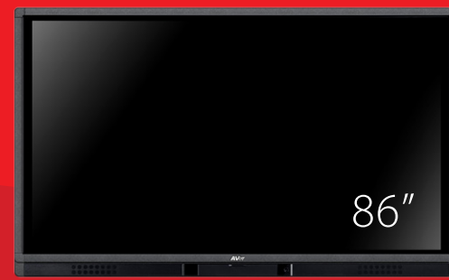
CP86 4K Ultra HD 86" interactive panel Part Number: AVIFPCP86