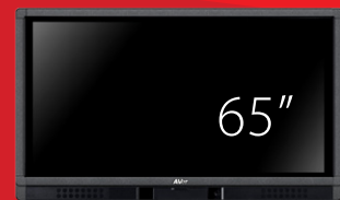
CP65 True HD 65" interactive panel Part Number: AVIFPCP65

Finally, technology with seamless collaboration and integration.