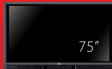
CP75 4K Ultra HD 75" interactive panel Part Number: AVIFPCP75