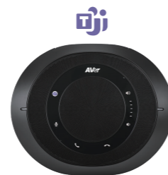
Microsoft Teams edition