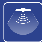
AVer Audio Fence