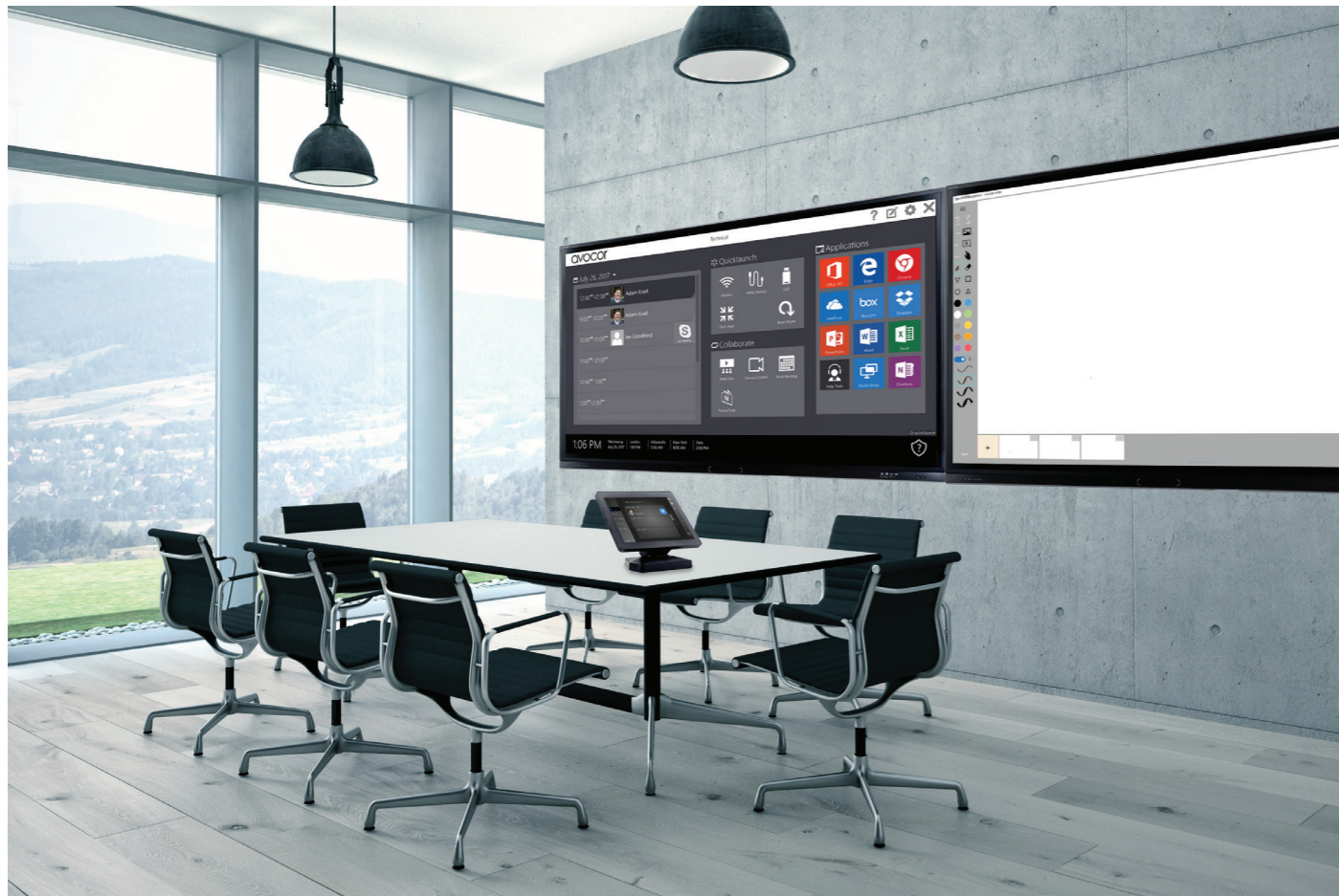
Dual display using Quicklaunch incorporating Mimio Table Console