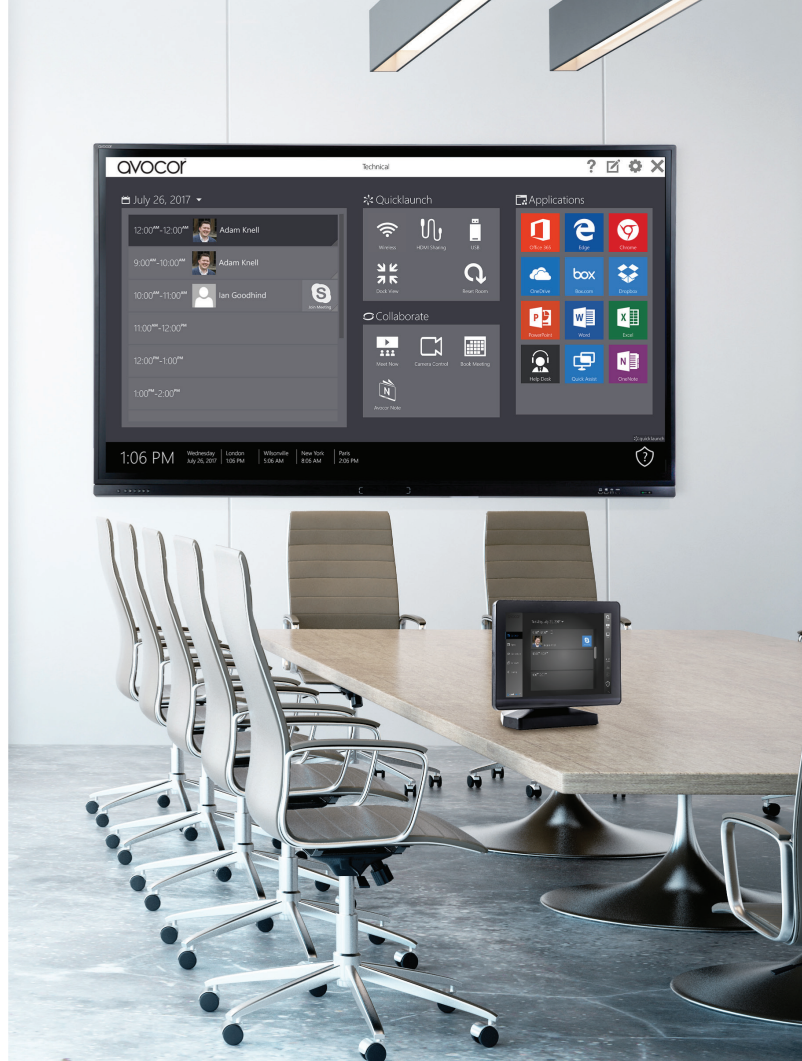
Single display using Mimio Table Console