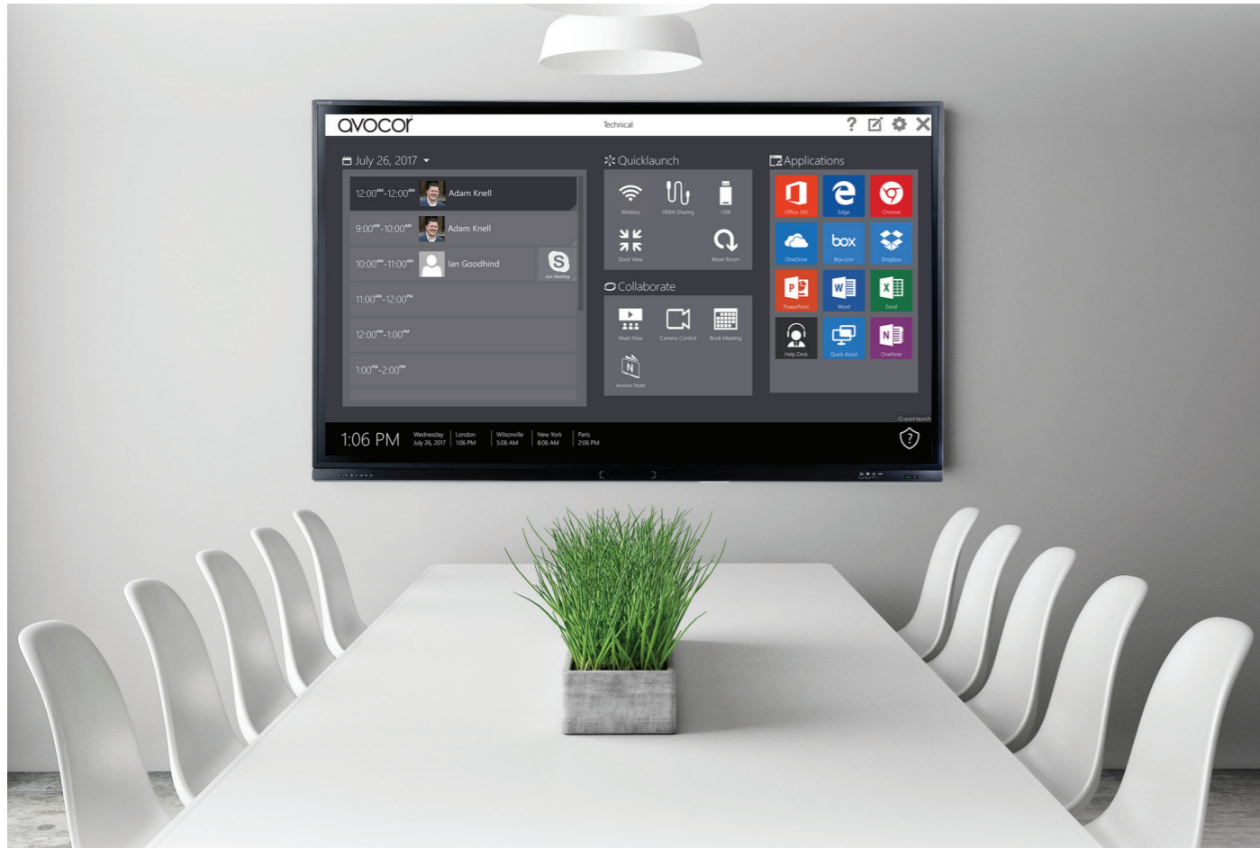
Single display using Quicklaunch