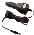
Vehicle Adaptor, 12 Vdc GA-V-CHRG4 Vehicle adaptor cable for base station power