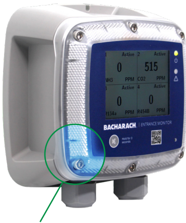
Perimeter Strobe Alarm Status Indication

For Commercial & Industrial Applications