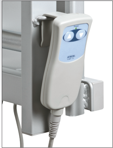
UL-approved electric system provides 18" of height adjustment with the touch of a button on the easy to use wired remote.