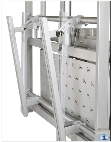
Brackets also provide tilt adjustment for the optimum viewing angle.