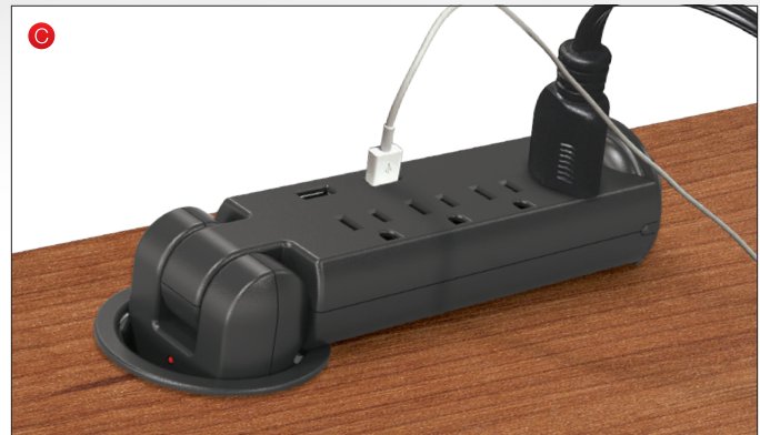
C10 laminate options: