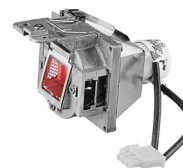
P/N: 5J.J9R05.001 / 5J.JC205.001