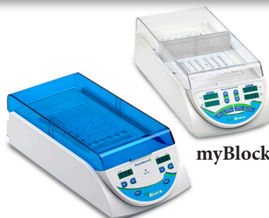
myBlock™ Dry Baths