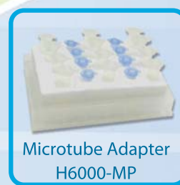
Microtube Adapter H6000-MP

Designed for application flexibility, the Incu-Mixer series is available in two, and four-plate capacities. The four-plate model features an increased chamber height for accepting plates up to 46mm high. Independent time, temperature and speed controls allow the mixer to function as 3 machines in one; a multi-plate incubator, vortexer, or a combination of the two. The Incu-Mixer MP series is ideal for a wide variety of molecular biology applications including immunochemical reactions, enzyme and protein analysis, and microarray analysis.