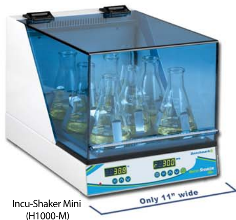
Incu-Shaker Mini (H1000-M)

Temperature, shaking speed and run time are displayed on the large LED control panel located on the front of the unit. The integral microprocessor includes a constant monitoring system that verifies and maintains accuracy through the duration of the program. Sophisticated over-temperature and over-speed controls ensure long life, safety and sample integrity.