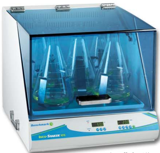
Incu-Shaker 10L (H1010)

The new Incu-Shaker™ series of shaking incubators provide digitally regulated temperature with precisely controlled, circular (orbital) mixing, optimized for the culture of a wide variety of cell types.