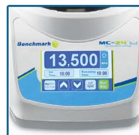
Full Color TouchScreen

Benchmark's MC-24 Touch is the first microcentrifuge in its class to feature touch screen control. In addition to the next generation control panel, the centrifuge also offers high speed (up to 13,500rpm/16,800xg) and a unique COMBI-Rotor™ that accepts both standard microtubes (1.5/2.0ml) and PCR tubes/strips (0.2ml), making this the perfect partner for any molecular biology laboratory.