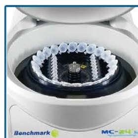
Unique Combi-Rotor™ Accepts tubes and strips