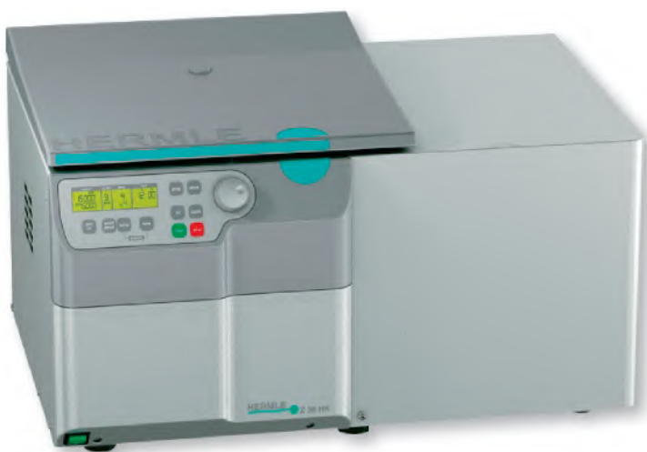
Refrigerated Super Speed Centrifuge Z36-HK