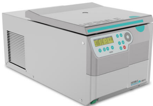
Universal Centrifuge Z327-K