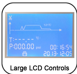
Large LCD Controls