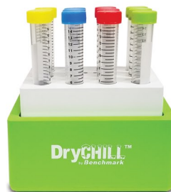
Item: DC1215 12 x 15 ml tubes (16-17mm)