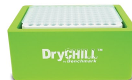
Item: DC9602 96 x 0.2 ml tubes or 1 x PCR plate