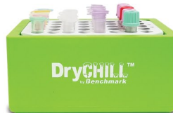
Item: DC4020 40 x 1.5/2.0 ml tubes