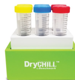
Item: DC0650 6 x 50 ml tubes (29mm)

The DryChill cooling blocks are designed to store samples safely on the lab-bench without sample degradation due to temperature increase or fluctuation. Unlike traditional ice buckets, these blocks do not require any ice and are uniquely designed to minimize condensation, resulting in a convenient, mess-free cooling.