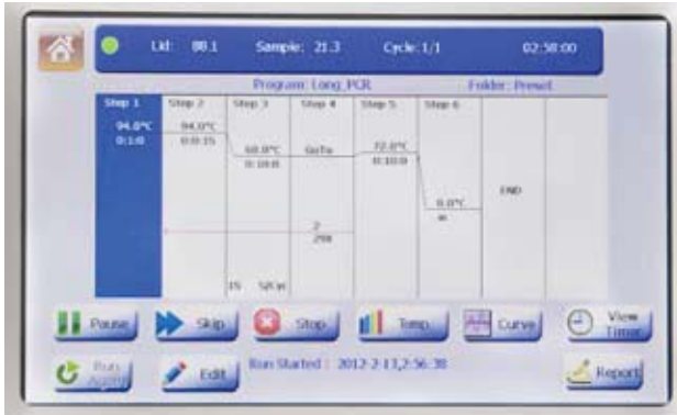
Screen shot of running program