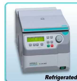
Z216-MK Refrigerated Microcentrifuge