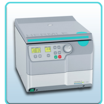
Z306 Universal Centrifuge