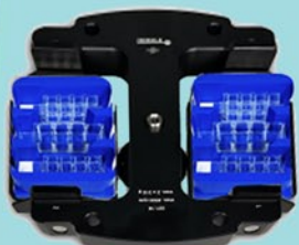
Z326-02MP Microplate rotor

Fits any Hermle microplate rotor or carrier!