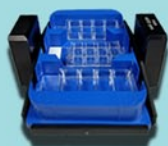
Z446-750-MP Microplate carriers