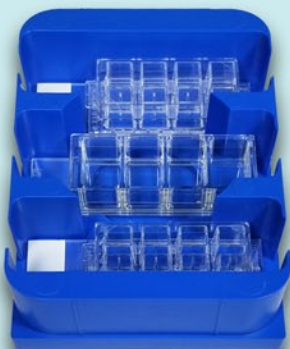
3 x chamber slides