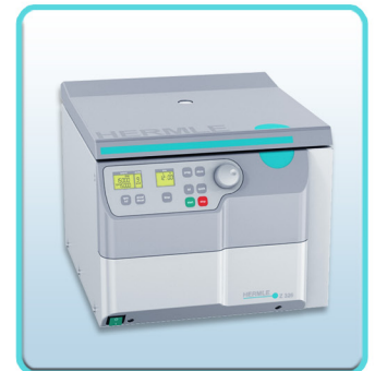
Z326 Universal Centrifuge