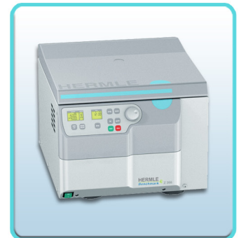
Z366 Universal Centrifuge