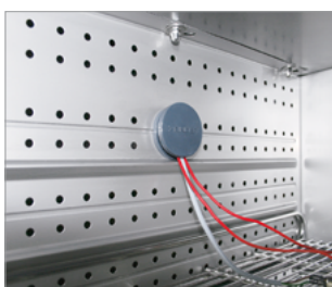
Access port with silicone plug

► All extras online go2binder.com/en-options