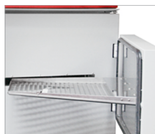
Coil coating door flap