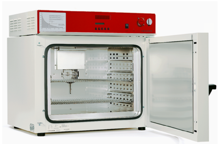
FDL 115 model