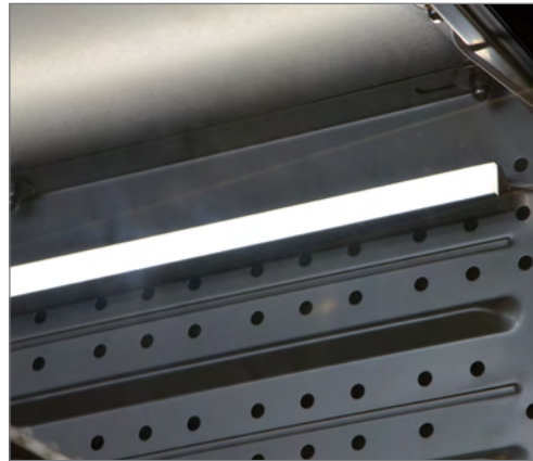
30 cm light bars, fastened to the side of the chamber with tesa Powerstrips®