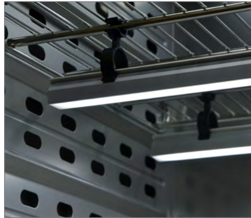
50 cm light bars, fastened to the rack with plastic clips