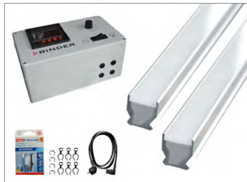
Basic set: scope of delivery