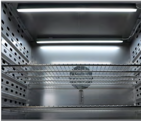
50 cm light bars, fastened to the chamber ceiling with tesa Powerstrips®