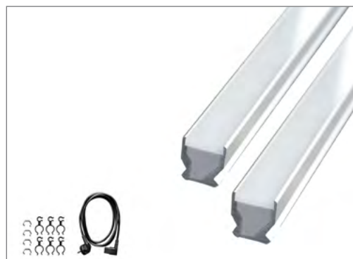
Expansion set: scope of delivery