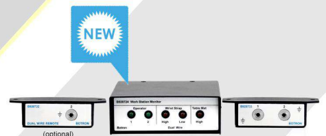
Resistive Dual Wire Monitor w/ Remote B920724 Dual Wire Monitor B920733 Remote for Dual Wire Monitor B920732 Optional Dual Wire Remote