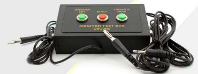
B9203TB Test Box for single wire monitors

The B9203TB should be used to verify the B9201, B92011, B9202 and B9203 Constant Monitors.