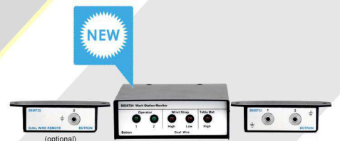
Resistive Dual Wire Monitor w/ Remote B920724 Dual Wire Monitor B920733 Remote for Dual Wire Monitor B920732 Optional Dual Wire Remote