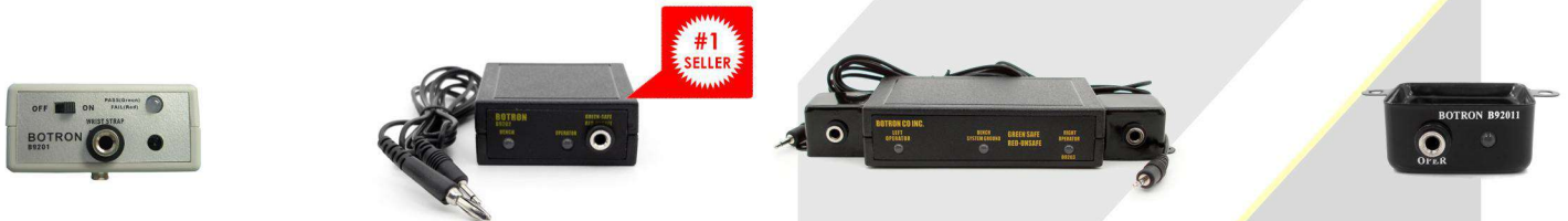
Continuous Monitors B9201 One Operator Continuous Monitor