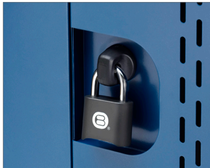
Inserting The Shackle / Lock Programming