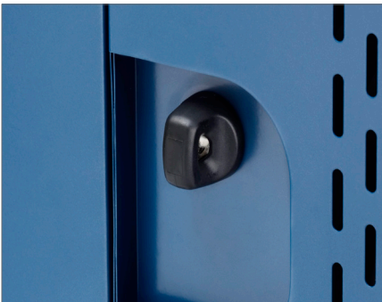
Using the Handle

Polypropylene dividers store devices vertically and offer optimal spacing for device compatibility.