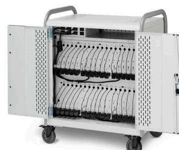
Pictured rear access double doors (MDMLAP36-CTAL)