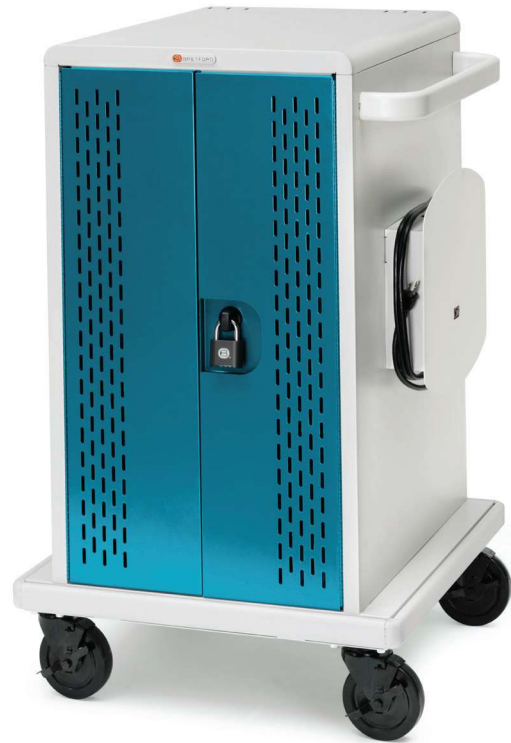
Core® M Cart shown in Arctic White (AW) & Pacific Blue (PB)

Keep Chromebooks, laptops and tablets charged and ready to go. The CORE® M Cart features a small footprint with a sleek customizable two-tone design, smart charging across devices, a secure locking system and world-class reliability.