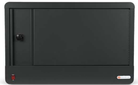
CUBE Micro Station® 10 & 16 shown in Charcoal (CK)