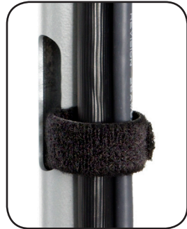
Integrated cord management