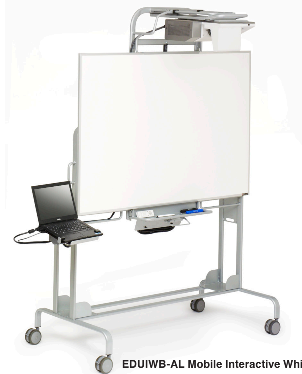
EDUIWB-AL Mobile Interactive Whiteboard