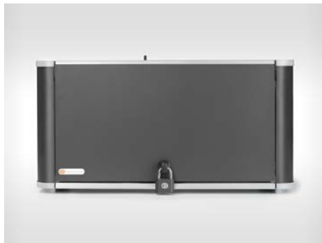
Devices are protected by all steel construction and a torque-resistant handle.