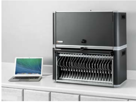
Stackable design allows for up to three units to be combined in a single footprint.