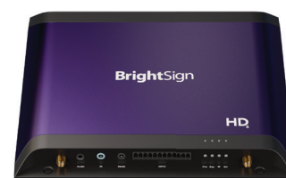
Expanded I/O Package