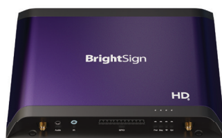
Standard I/O Package