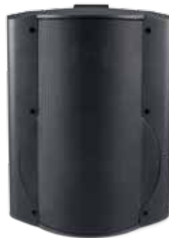
With a Non-Amplified Speaker P602B