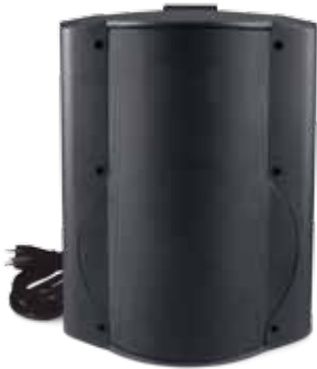
Amplified Speaker AMP602B