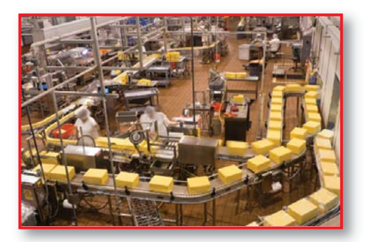
Track food production lines