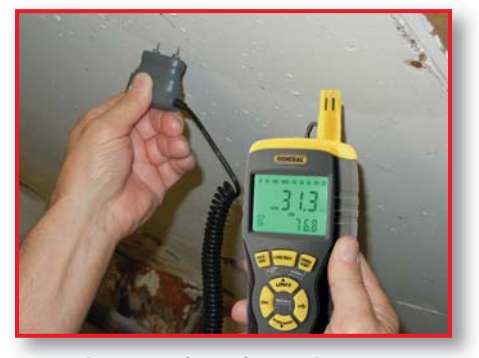
Locate moisture/water damage