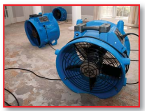
Check ambient temperature and humidity during restoration drying