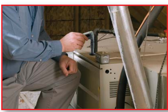
Measuring a system's enthalpy of vaporization