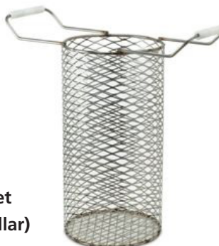
IFB-51 Basket (without collar)

All other larger IFB units have a robust stainless steel lid which supports the load of the basket and tooling. These also form part of the fume extraction system.