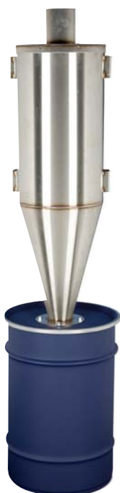
CN-100 Cyclone and collection bin

The CN-100 is an efficient wall mounted unit which can extract more than 99% of any fluidising medium that may be carried over into the bath exhaust system when the extraction fan is in operation. The cyclone includes a collection bin which allows alundum carried over to be collected and returned to the bath for re-use. An extraction fan and cyclone are recommended unless a suitable extraction hood or fume extraction system is already in place.