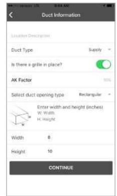
Enter duct information