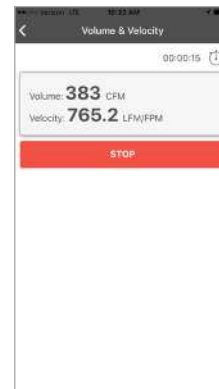
Volume & Velocity test screen