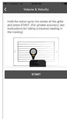
On screen guidance for measuring airflow