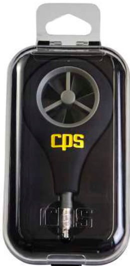
ABM-100 packed in clamshell (included)