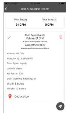
Test & Balance Report