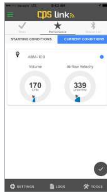
Current conditions screen