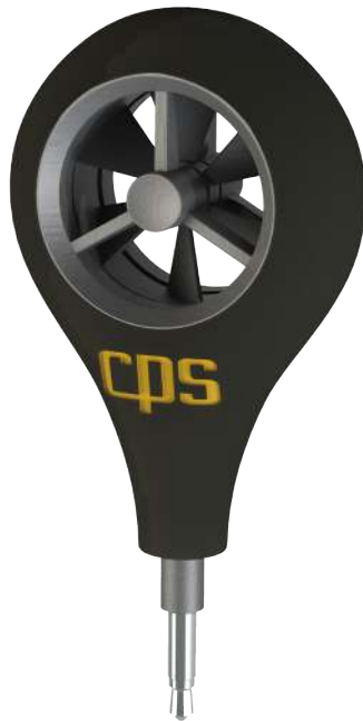
Ways to attach ABM-100 for airflow analysis