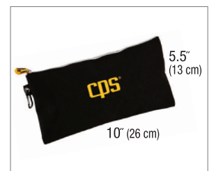
Cloth Storage Pouch